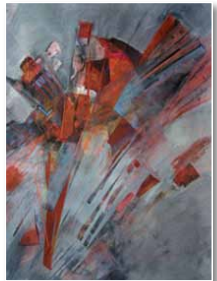
Bloom'n'Gloom Acrylic by Pamela Hake