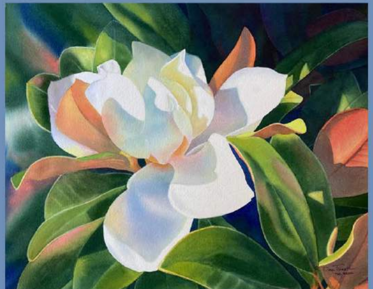
4th Place "Southern Magnolia" Dee Tunseth