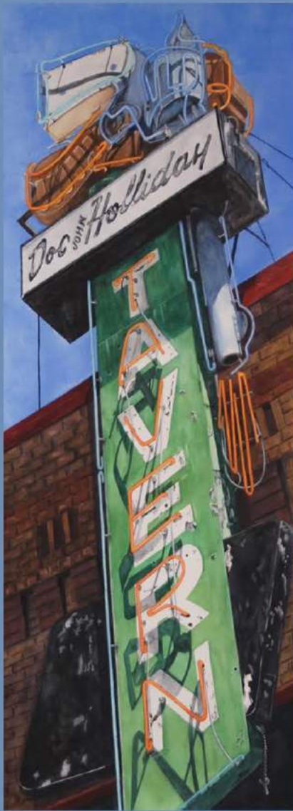
“Docs Tavern” Sheryl Brake