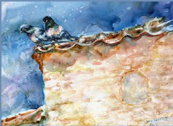
“Viewing From the Roof” Lou Ann Sosalla