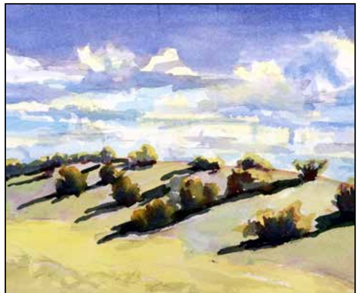
Steve Ekblad Pinyon Pine Western Federation of Watercolor Societies Exhibition