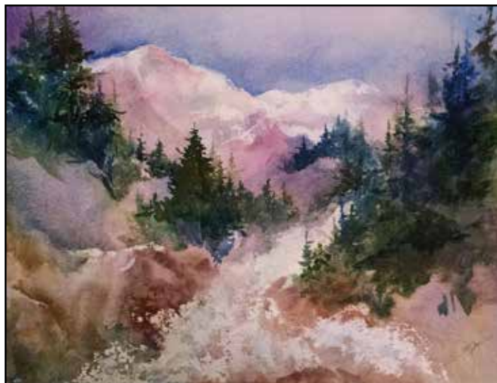
Joan Judge Meltdown CWS State Watercolor Exhibition