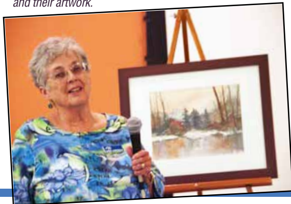
New members introduce themselves and their artwork.