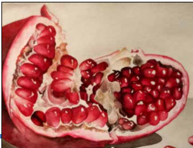
Seeds of the Season