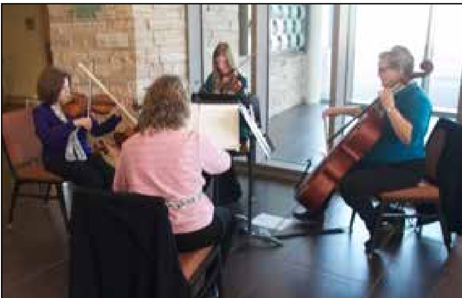
Mountain Air String Quartet provided entertainment