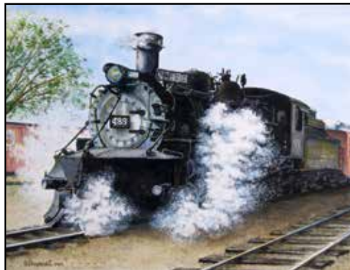
Steel & Steam

Every member of CWS should take a few minutes to reflect back on this great show and then plot out your strategy to prepare for the next one. That opportunity is just around the corner - The Member Show in July. The venue is chosen and the prospectus is being completed. So, start painting and, don't forget one last thing... Enjoy!