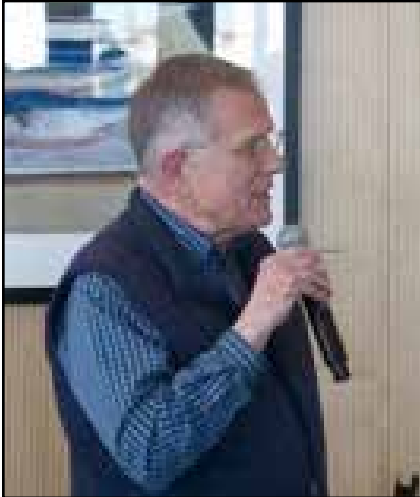
President Greg Chapleski welcoming the 450 plus attendees at the opening reception.