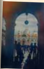
St. Mark's Basilica