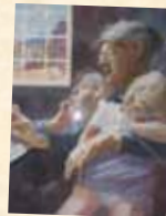
Grandmother's Laptop by Donald Willis