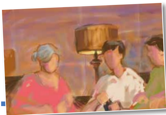
Sketch done on-site at a coffee shop using my iPhone