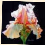
Peach Iris by Tanis Bula