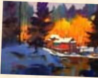
Ward Lake - Grand Mesa by Frank Francese