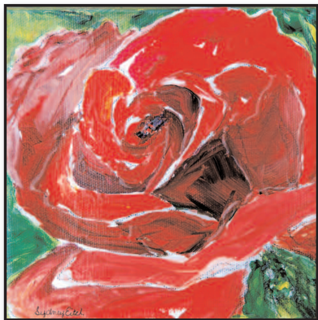
Sydney Eitel, Rose , acrylic, 6 x 6 inches.