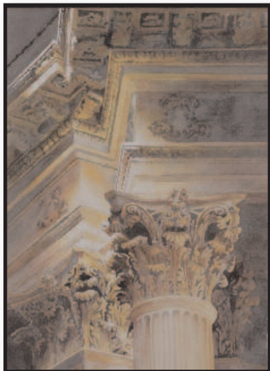
Diane Fechenbach, Capital Morning 2

To refresh our memories of these fine jurors, I've prepared a brief resume of each along with an image of one of their paintings.