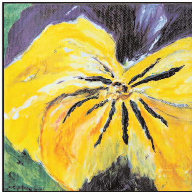
Sydney Eitel, Pansy , acrylic, 6 x 6 inches.

The Board is going to have a special meeting soon to discuss such things as how we can create more excitement and interest in CWS that entices members to want to volunteer, how we can reach out to the many members that do not live in the metro Denver area, and how we can increase membership. CWS is a state wide non-profit organization that is operated by volunteers. We want CWS to be the best it can be where members are involved and encouraged; painters meeting with painters sharing a common interest in painting. Please send me your ideas, interests, and concerns. I will share them with the Board and we will see what we might be able to do to increase our membership, increase our percentage of volunteers, involve artists living out and away from the Denver area and enhance the experience of being a member of CWS. You can email me at sydneyeitel@hotmail.com with your thoughts.