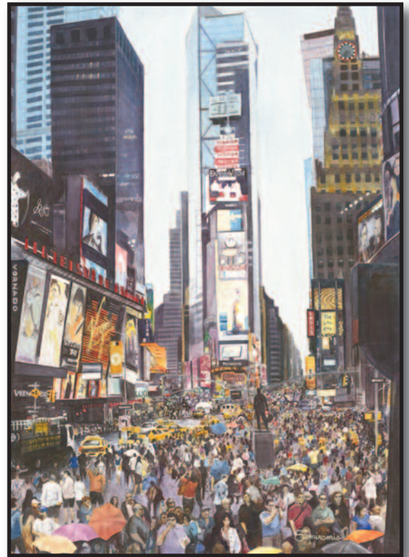
Semitramis, Times Square , Best of Show Award