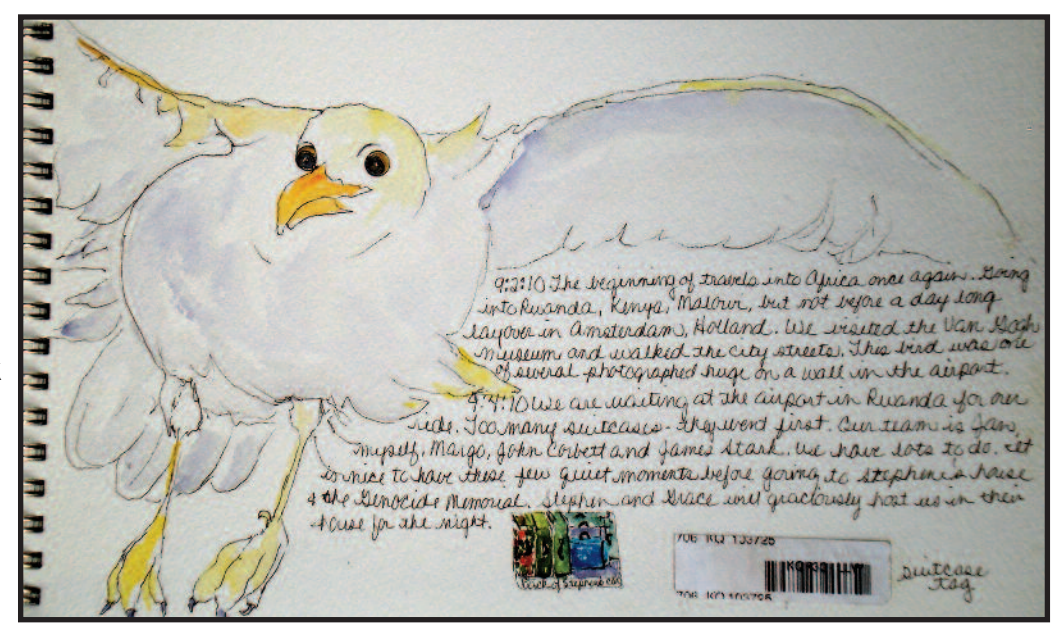
Sydney Eitel, Traveling to Africa, 2010 Journal Page, watercolor and pen, 6 x 10 inches.

I have recently tried out a brush that holds water in the handle. All you need is a small container of paint and water in