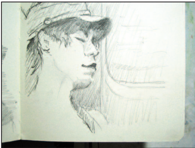
Sketch of a sleeping passenger in a flight from Atlanta

On the plane: Okay, so you are trapped in and buckled up... but your imagination does not have to be! Sketching on the plane is a great way to pass the time and hone up your skills. Here are a couple of my favorite exercises.