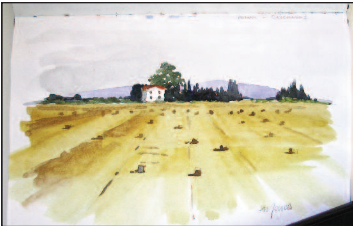
Study composed of different elements, done on a moving train in Majorca

On the plane: Okay, so you are trapped in and buckled up... but your imagination does not have to be! Sketching on the plane is a great way to pass the time and hone up your skills. Here are a couple of my favorite exercises.