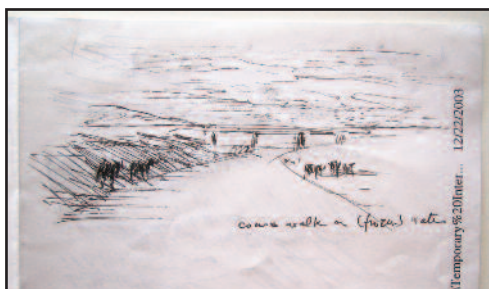
Sketch made on a spare sheet of paper from a moving car during a trip through Wyoming. Notice how I only had time to simply suggest the shapes of the cows.

In a moving car: If you are a passenger, and stopping is not an option, you may have to work fast to capture the scene passing you by. You are moving fast, so views won't be available for long. One option is to sketch the broad