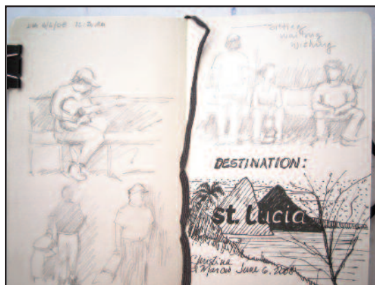
Sketches of passengers waiting at the airport in Denver

From the train: Try to get a window seat, which gives you not only a view of the landscape but also a better view of other passengers. If the