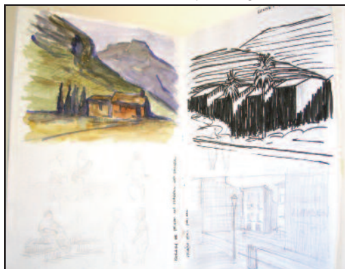
Sketches made from the train in Majorca

landscape ahead, or focus instead on elements that repeat along the way and you can combine into one sketch. For example, if you are driving through farmland, you can draw cows, or barns... the tactic is the same, start with the general shape of the first barn, then complete with the windows of the next, then the door of the next, and so on. Remember the primary goal is to practice, not to faithfully record a thing or place.