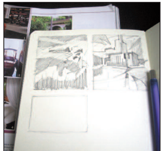
Small value sketches during a flight, based on magazine photos

Next time you are on the road, on the track or in the air, consider this great opportunity to practice and make the journey more enjoyable!