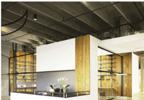
Red Line Gallery

In the event of a snowstorm, our snow day is Saturday, February 20. In setting up this program, I've visited the facility twice. Please join us. It is a very interesting and innovative gallery, and the new show sounds very intriguing. Note that this replaces our General Meeting normally scheduled for Tuesday, February 16!