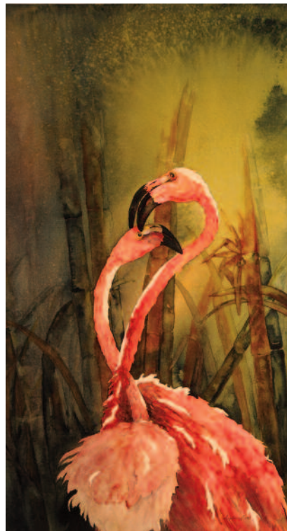
Sydney Eitel, Twisted Love , watercolor, 20.5 x 10.5 inches.