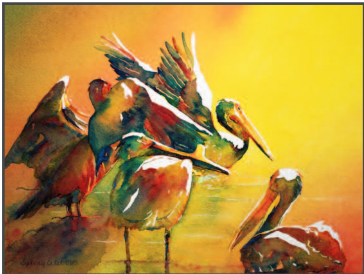
Sydney Eitel, The Gathering Place , watercolor, 10 x 13 inches.

Who can you go to? Who is the Board of the Colorado Watercolor Society (CWS)? How do they serve the members of CWS?