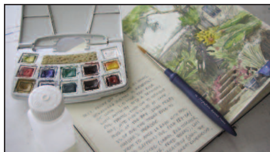
Marcio's Minimal Kit.

We will return to the why's and how's of plein air painting in a future article, but meanwhile, pack up light to make the most of your painting experience, and reach for new heights.