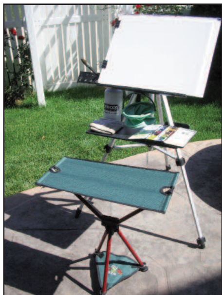
Marcio's full plein air setup.

Artists paint en plein air for many of the same reasons climbers climb. The process itself is fun and connects you with nature and the world. It is unpredictable, poses challenges and forces you out of your comfort zone. Once completed, it puts you on top of the world - you have expanded your limits, developed new skills, learned something new about yourself and your surroundings, and returned with