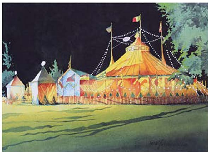
FIRST PLACE Gene Youngman "Circus Light"