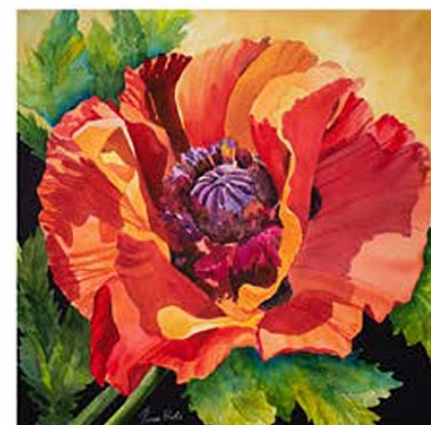
Chuck Danforth AWARD Tanis Bula "Poppy in Sunlight"