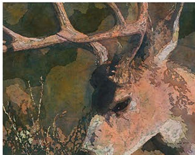
SECOND PLACE Linda Renaud "Sticky Wicket dining"