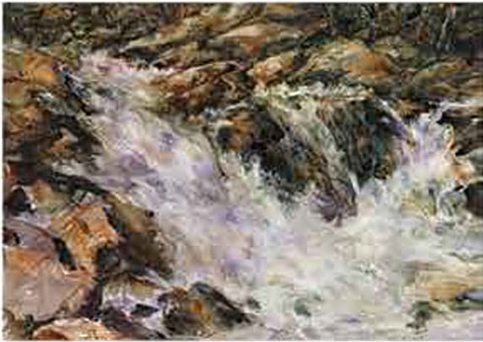
BEST OF SHOW "Rushing" Lou Sosalla