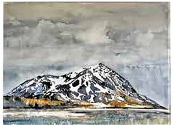
3rd PLACE "MOUNT CRESTED BUTTE" Karen Hill