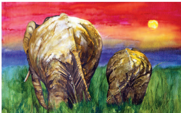
Sydney Eitel, Walking Into The Sunrise , watercolor, 15 x 23.5 inches.