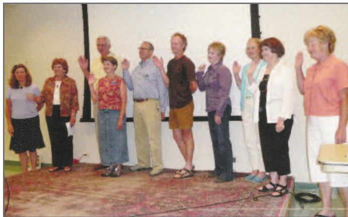
CWS Executive Board swears in at the June General Meeting.