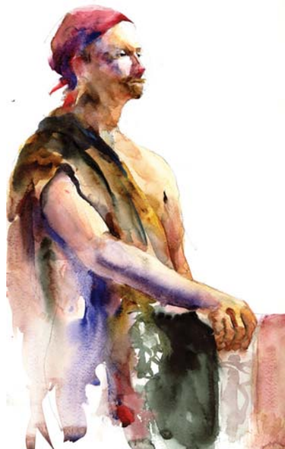
Chris Jensen, Red Bandana, watercolor, 13 7/16 x 10 5/16 inches, CWS 17th Annual State Exhibit Best of Show Award