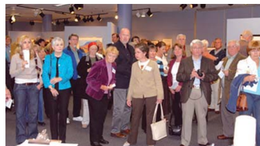
Onlookers at the Opening Ceremonies