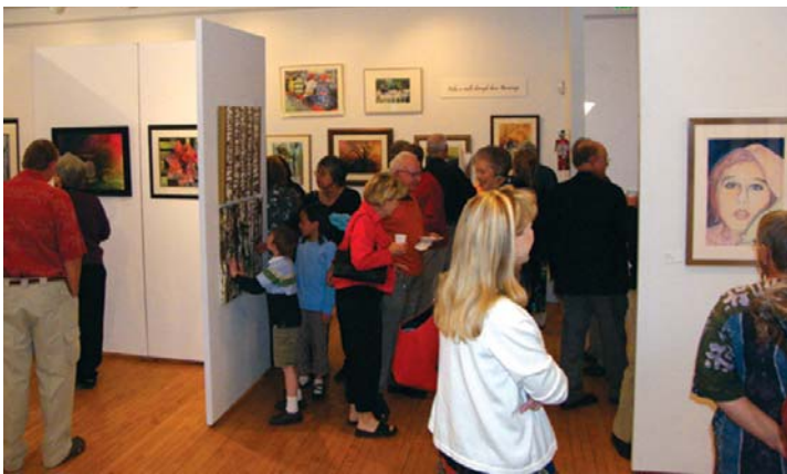
Attendees studying the art at the New Trends Opening