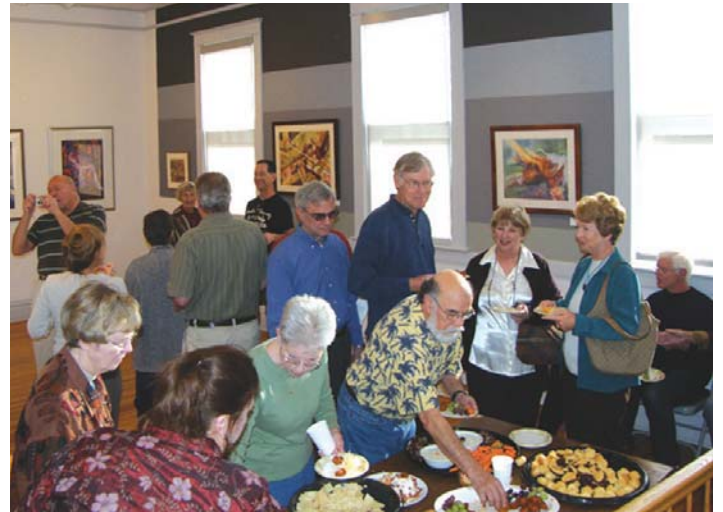
Attendees to the New Trends Opening enjoying good art, good food and conversation.