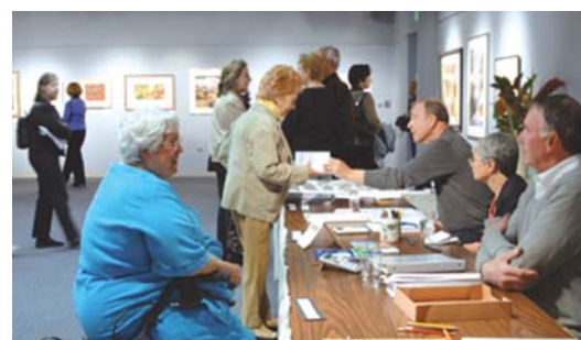
Volunteers helping at the desk during the Opening.