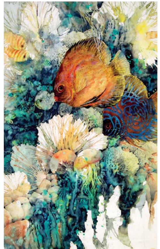
Lian Zhen, untitled workshop painting, watercolor