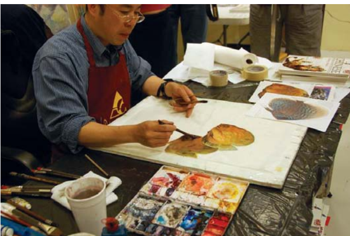
Lian Zhen painting detail during demonstration