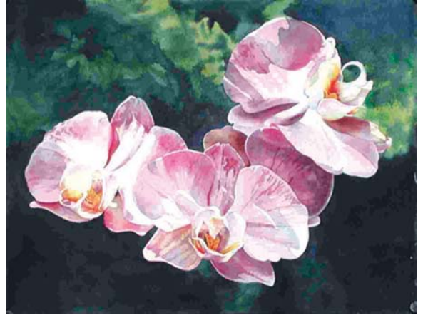
Jean Cole, "Butterfly Orchids", watercolor, 9x12 inches

In addition to the subjects she paints, Jean is fascinated by how watercolor paint works. "I love the way a pigment reacts to the water, the layering of paint and the way the light shines through the pigment," she says. Her characteristically deep, brilliant colors come not just from one favorite brand of paint, but from many different ones. Her paint selections are inspired by the Wilcox Guide to the Best Watercolor Paints , which rates qualities of all the brands of watercolor on the market, and every color within each brand.