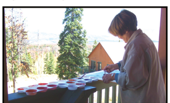
Watercolor, Fabric Arts, Personal Life Coaching