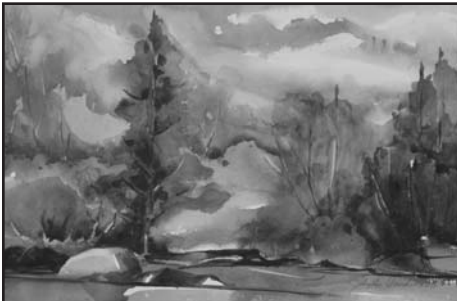
Phyllis Vandelaar A Blaze of Glory , Watercolor