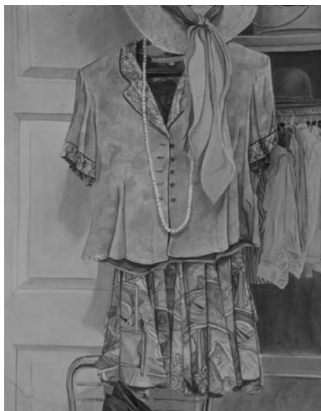
Elizabeth Line The Dressing Room Watercolor Third Place, Botanic Gardens Show