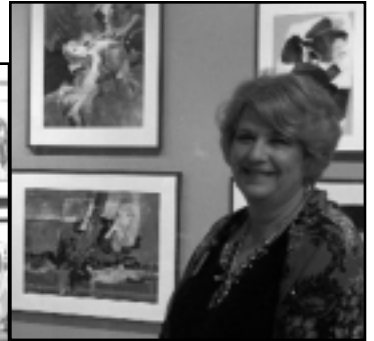
Pamela Gilmore Hake (upper left painting)