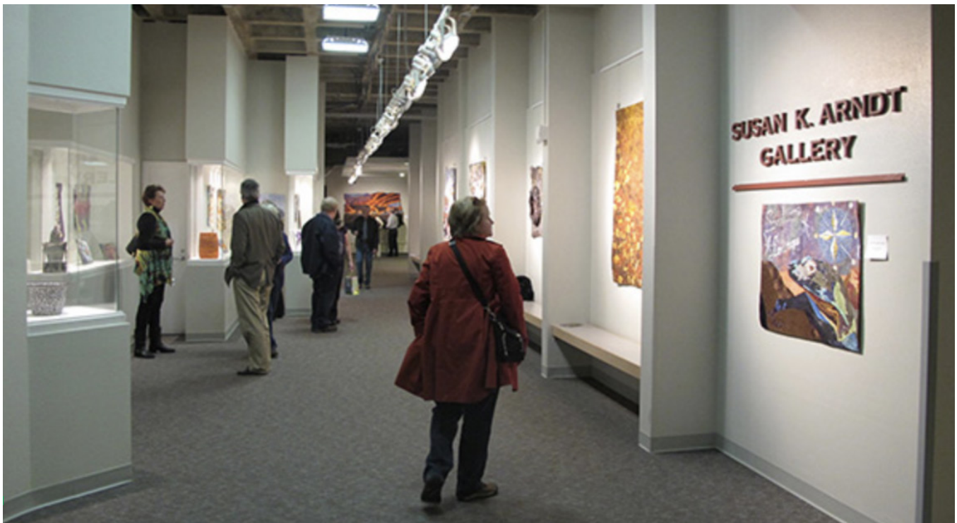
Susan K Arndt Art Gallery at Red Rocks Community College, Lakewood Campus