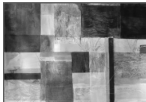
My workshop painting – Crazy Quilt Estuary

positive way. Most participants had an instructive and fun time. I know I did. Thank You for a wonderful experience.