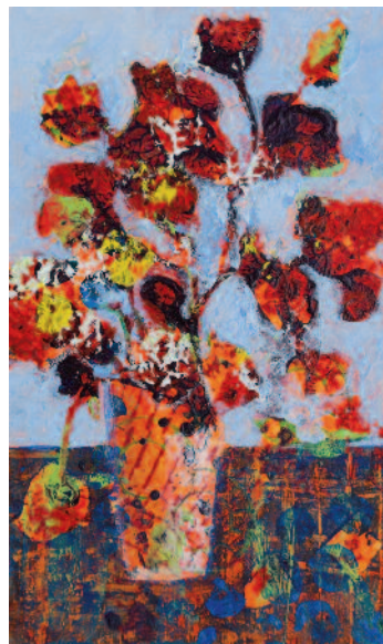
Valli Thayer McDougale, Spring Blooms #2 .