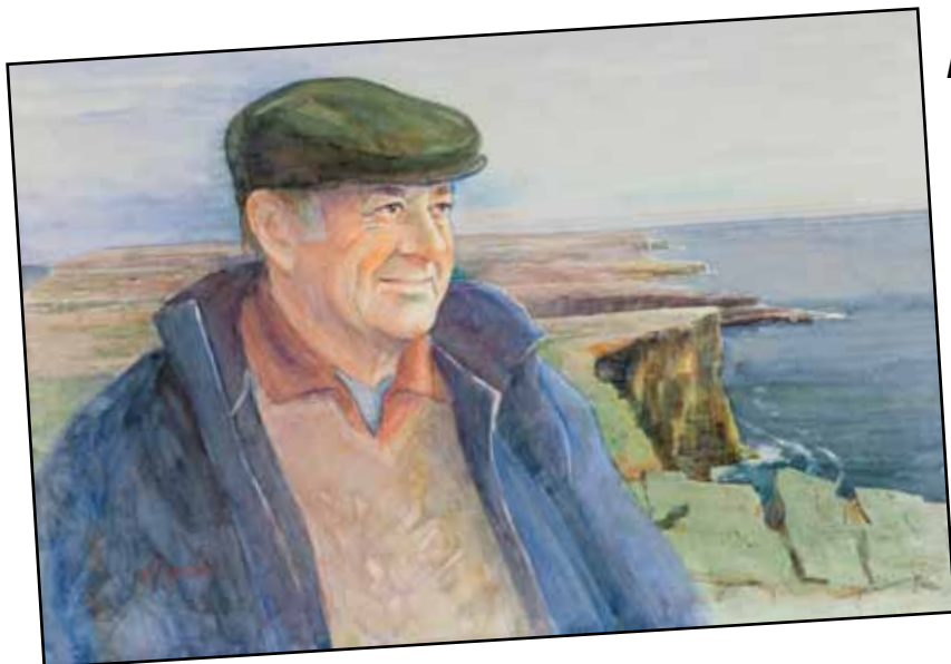
Looking Out to Sea, 15x22

We are very proud of our CWS artists, and hope many more will join them in participating in the Western Fed. Thirteen of our members are one acceptance away from becoming WFWS signature members... maybe next year! Till then, have a great summer and see you all at the Ice Cream Social in the September meeting!