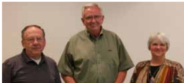
New CWS Signature Members