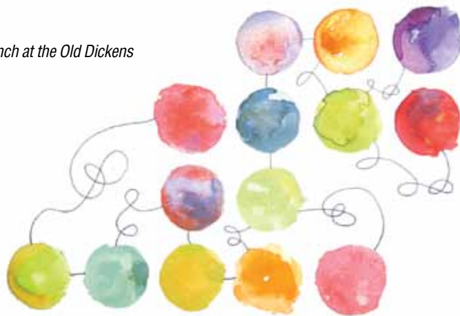
Lunch at the Old Dickens

So it is important to stick to your goals and to your work, even if ( and especially if ) the result is not what you expected-If you did not get into a given juried show, or you feel a creative block, it is time to keep on sketching, preparing, reading, studying, attending lessons and demos and all the activities that keep your artistic self in motion. A lot of those activities can be found in CWS events and programs, which is a good reason to persist on their attendance and contribution to our Society. 2013 will be full of great events, starting with the CWS State Show next month, and excellent workshops by top notch instructors. I look forward to seeing you at the next meeting, and leave you with a thought mis ( quoted ) from Ted Nuttall: Inside of you, there is a masterpiece waiting to happen!