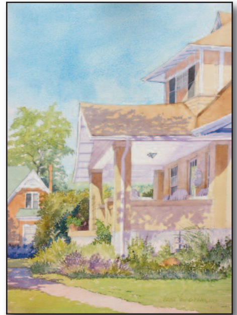
Gene Youngmann, On The Porch , watercolor, 11 x 14 inches.

Experience the challenge of painting on location and completing a painting from start to finish in less than three hours while learning from a master watercolorist. Instruction will include selecting a location, creating an interesting composition and how an under glazing on the painting surface can create unity to the composition. Students will learn techniques in traveling light, limiting supplies needed for on location painting and how to build a light weight painting board. Each painting session will be at a different location in the historic mountain town of Georgetown, and include individual instruction, student painting time and a group critique at the end of the session by the instructor. This workshop is co-hosted by the Colorado Watercolor Society and the Georgetown Gallery.