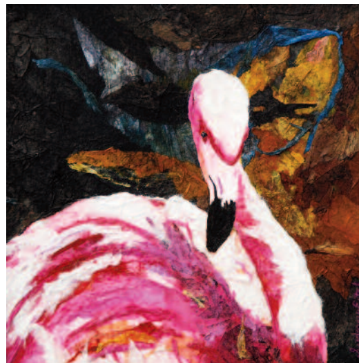
Sydney Eitel, Sitting Pink , watercolor collage, 8 x 8 inches.