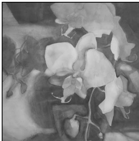
Morning Light Jean A Brodie Watercolor WFWS31 Finalist