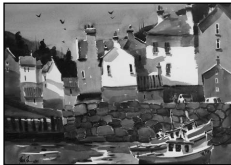
Whitbey, England West Frank Francese Watercolor WFWS31 Finalist