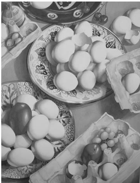
Eggs-Perance Diana Carmody Watercolor. WFWS31 Finalist