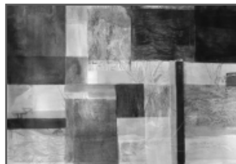
My workshop painting – Crazy Quilt Estuary

positive way. Most participants had an instructive and fun time. I know I did. Thank You for a wonderful experience.